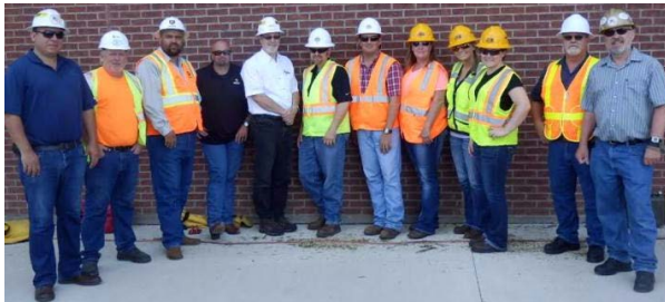
We had a NUCA Train-the-Trainer session in Coppell.