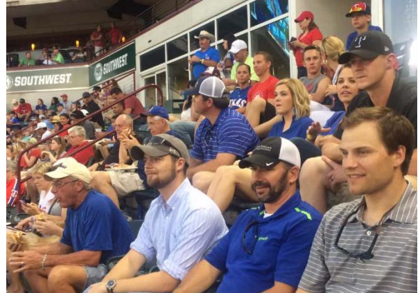
Seventy of us spent an evening between our First Base Corner Club room and the stands at Globe life park.